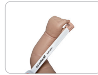
Inf thumb application