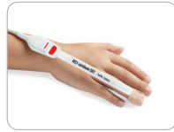
Inf finger application