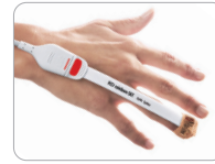
Neo adult finger application