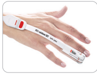
Adt finger application