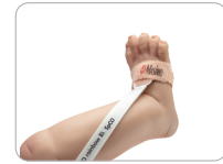
Neo neonatal foot application