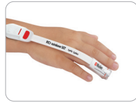
Pdt finger application